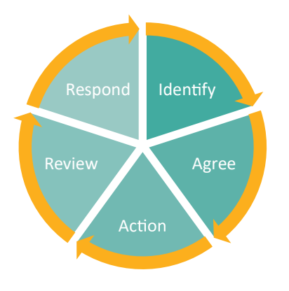
Figure 1: The Local Housing Action Plan Iterative Process

This is an iterative process (see Figure 1) that does not intend to duplicate existing actions of Council or the actions under the Queensland Housing Strategy 2017-2027 or the Housing and Homelessness Action Plan 2021-2025. It seeks to identify opportunities, consider an agreed response, develop targeted actions on key priorities and enable ongoing review of effort to adapt and respond to changing needs.